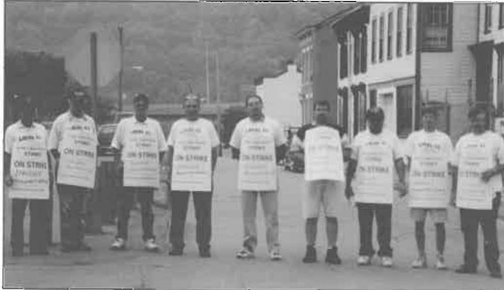
STRIKING are employees of Schodder Manufacturing Co. and members of Sheet Metal Workers Local 33.