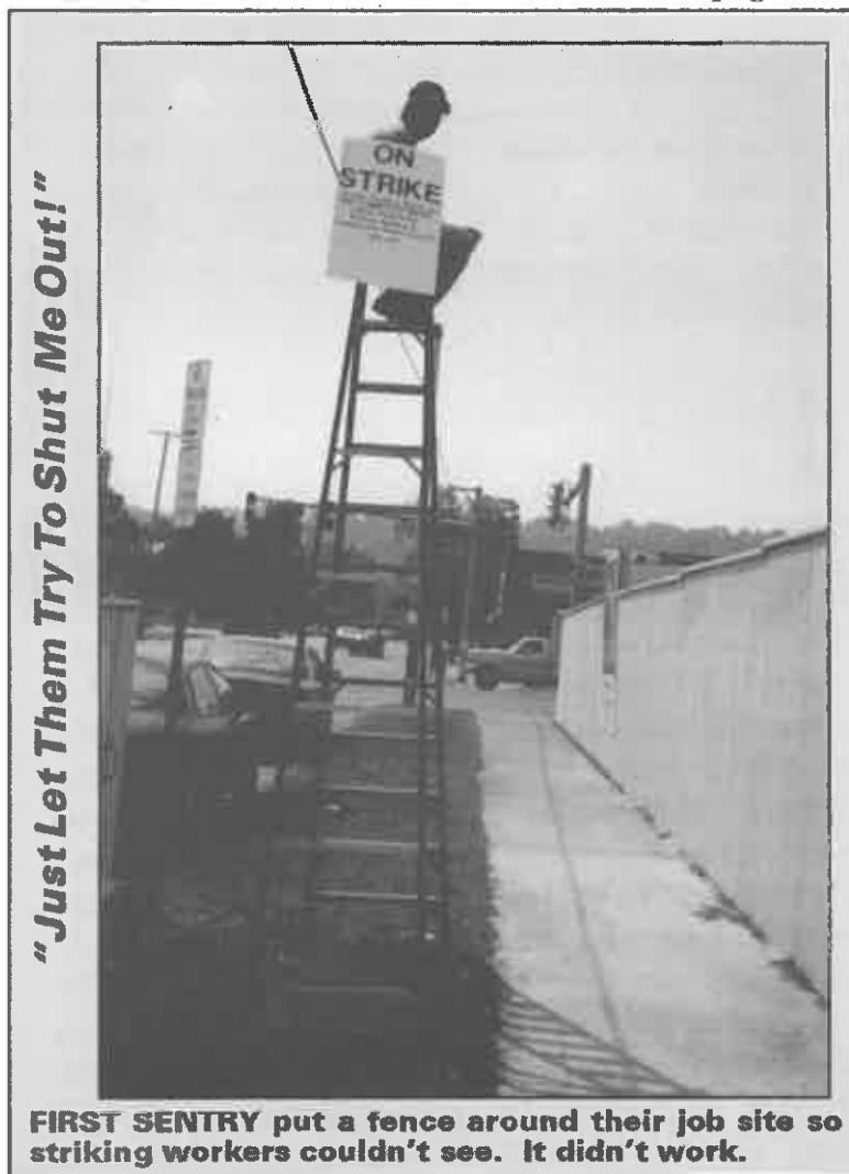
FIRST SENTRY put a fence around their job site so striking workers couldn't see. It didn't work.