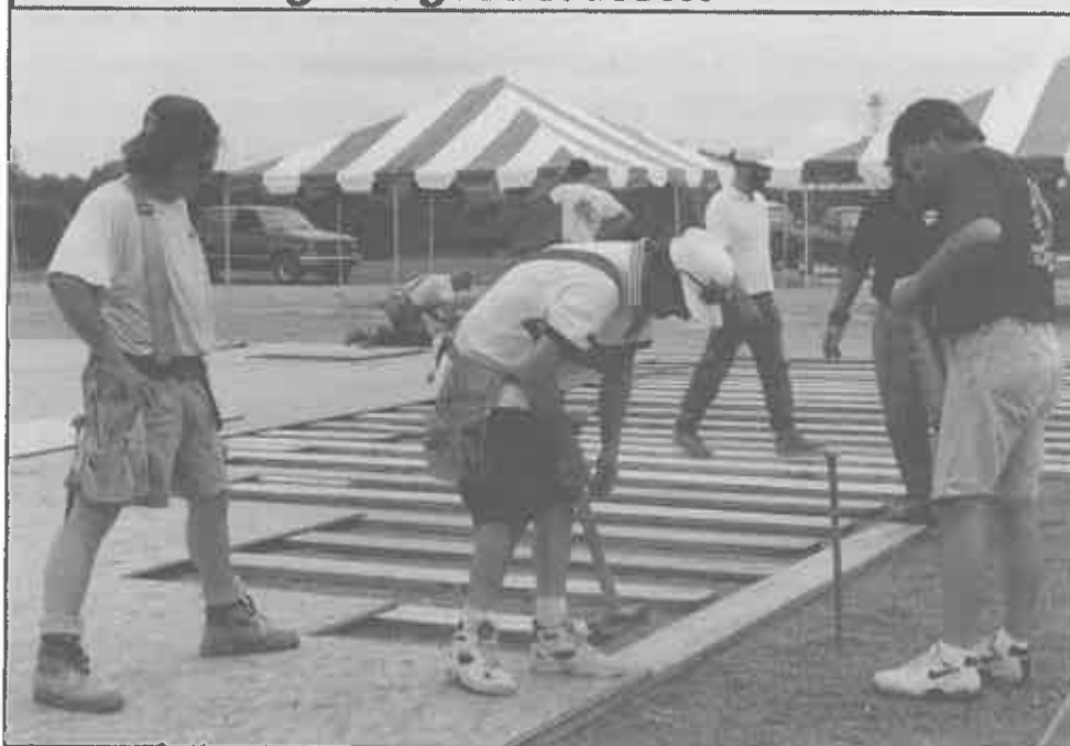
HELPING BIG BROTHERS & BIG SISTERS build a dance floor for a fundraiser in Charleston were members of Carpenters 1207, Ironworkers 301, Boilermakers 667, Charleston Building Trades, State Building Trades, Sheet Metal Workers 33, Millwrights 1755, Cement Masons 887 and Bricklayers 9.