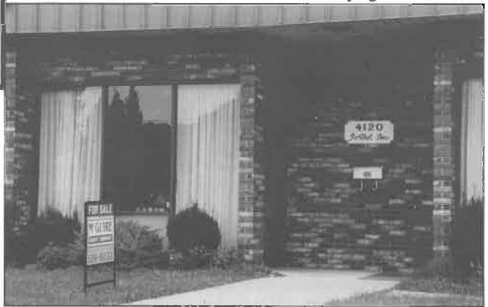
JO-DEL'S Company headquarters, located in Huntington, are for sale.