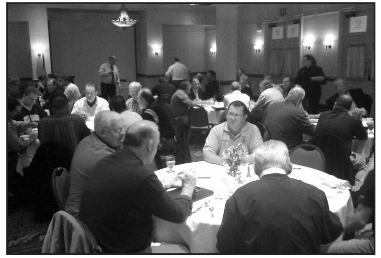
MORE THAN 60 contractor and labor representatives met in Parkersburg to discuss ways they can work together and get more opportunities for local construction workers and contractors.

Marcellus Shale gas fields in West Virginia, Pennsylvania and New York in the next ten years.