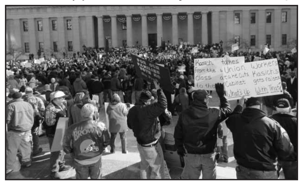
OHIO WORKERS RALLY against passage of SB-5, a law to take away the rights of public employees, at the State Capitol in March.

Limiting the extent prevailing wage protections were removed from $5 mil-Continued on p. 4