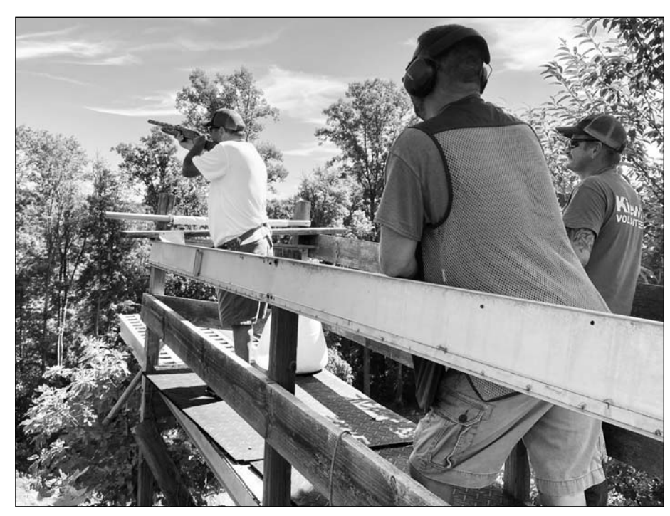
Members from the Parkersburg-Marietta Building Trades compete in the annual DAD's Day Sporting Clay Shoot at Hilltop Sports in Whipple, Ohio on July 30.

Since DAD's Day was first initiated in 1987, more than $57 million has been raised to support research