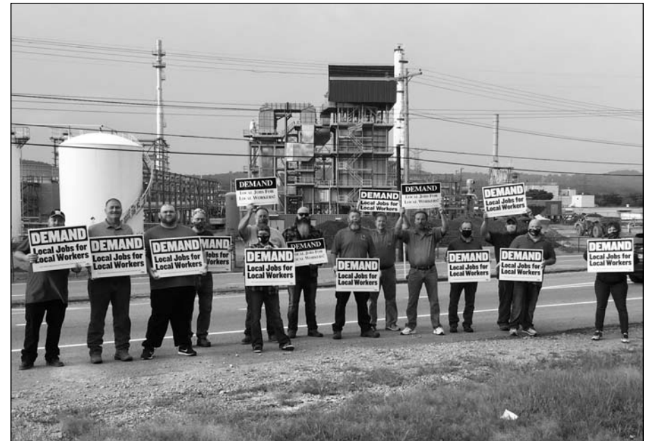
Members of Plumbers and Pipefitters Local 625, and other supporters, rally outside of the US Methanol site at Institute, WV in 2020, following the award of a piping subcontract to nonunion firm APTIM from Louisiana.